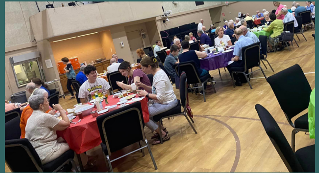
Celebrating God's Grace