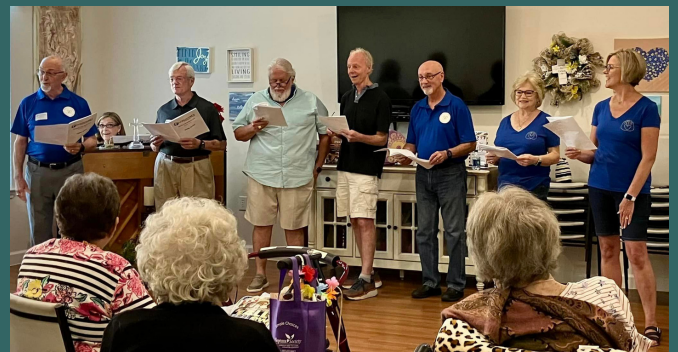
Making A Difference