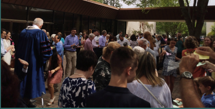
We are Christ's Disciples